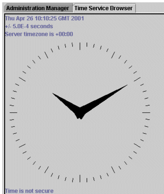
Figure 2 Time Service Browser

The Time Service Browser displays the time from the Time Server or Universal Time Object. The time is shown as text and also in graphical form, as illustrated in Figure 2 . The time display is in terms of the local time zone and is updated every second. The display is re-synchronised with the server once per minute.